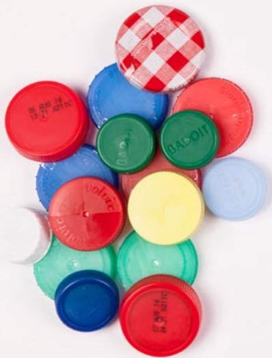
Lots of bottle tops or jam jar lids